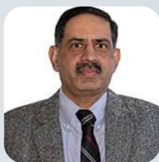
Prof. Balram Bhargava Secretary DHR, Director General Indian Council of Medical Research, New Delhi